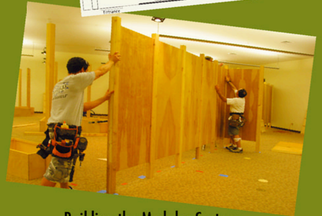
Building the Modular System