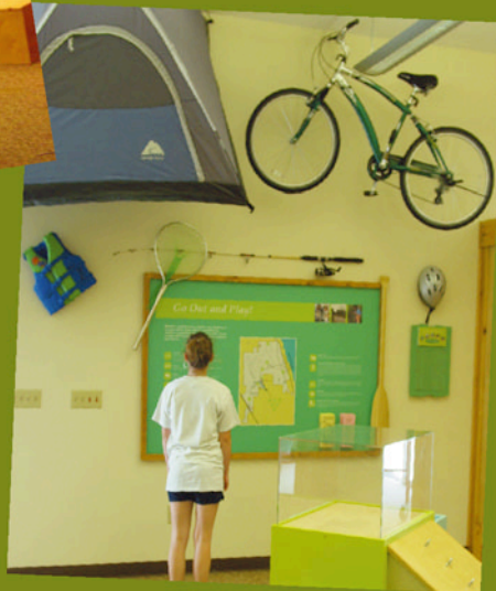
Learning About Recreational Resources