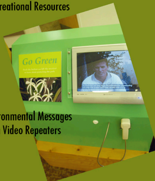
Environmental Messages on Video Repeaters

Models of birds and animals in micro-habitats are great alternatives to taxidermed mounts. There are many talented wood carvers that can provide exhibit components that are durable, won't attract pests and look great!