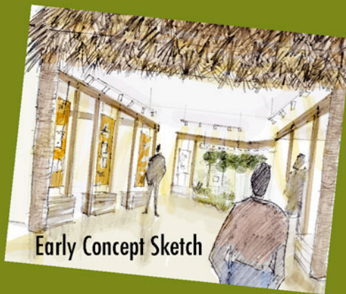
Early Concept Sketch