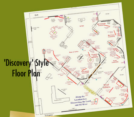
'Discovery' Style Floor Plan